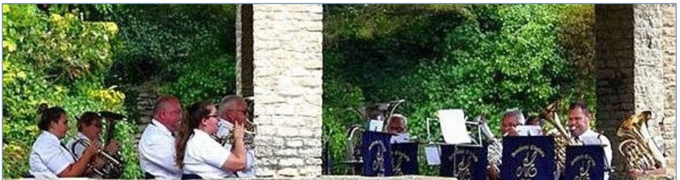
Members of The Armthorpe and Elmfield Brass band playing in The Dell.

As ever, if you have any ideas, questions or suggestions or are interested in helping in the park you can contact us online @hexthorpepark or at the Hexpress contact on page 2.