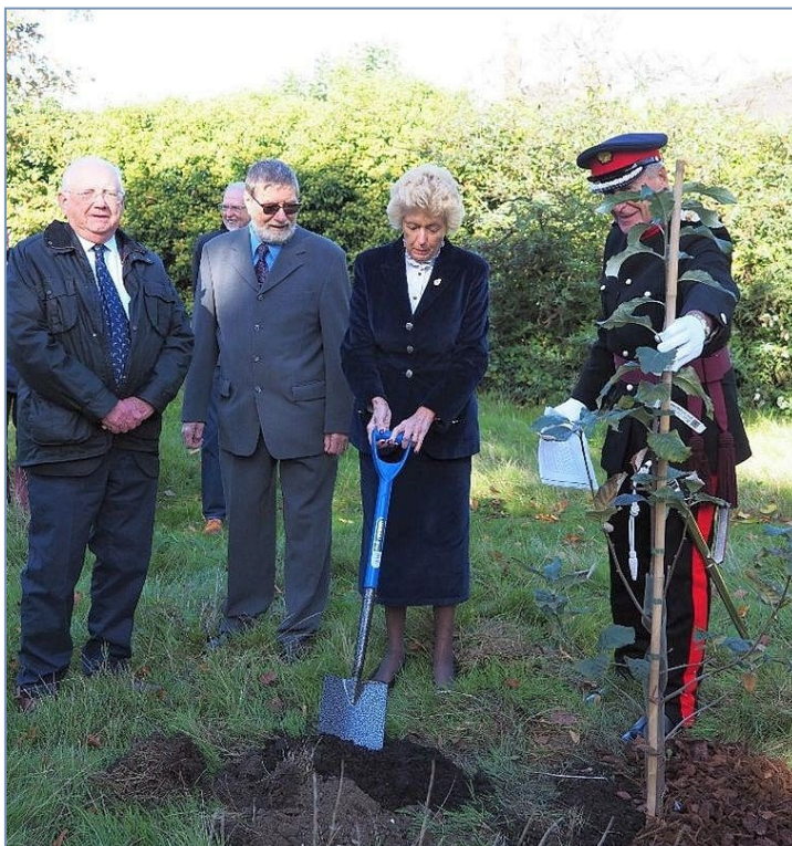
The sapling from The Tree of Trees Sculpture is planted in the Dell' (see page 7)