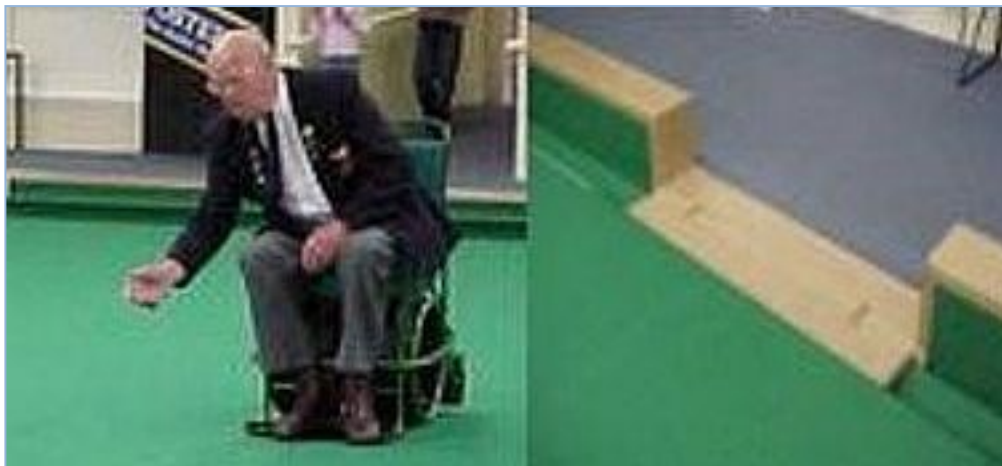
The Club boasts excellent access facilities throughout the premises. We have disabled access to the green using the gutter ramp and two specialised bowls buggies for wheelchair bowlers.