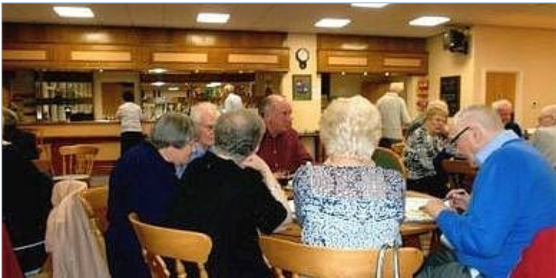
The Club has a large lounge and bar area where bar meals and drinks can be obtained.