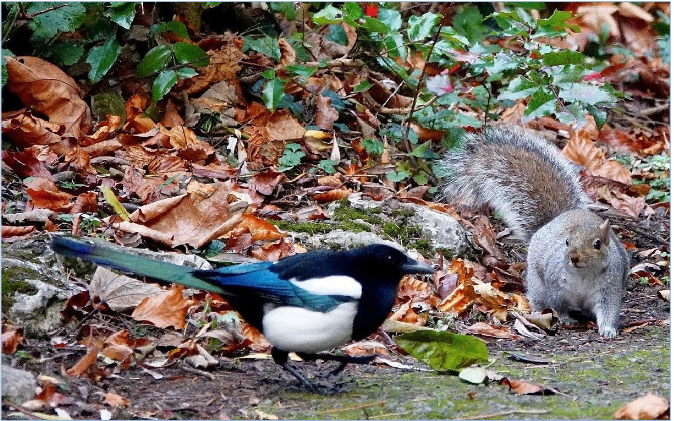
The Magpie has a date with the Squirrel in Hexthorpe Flatts