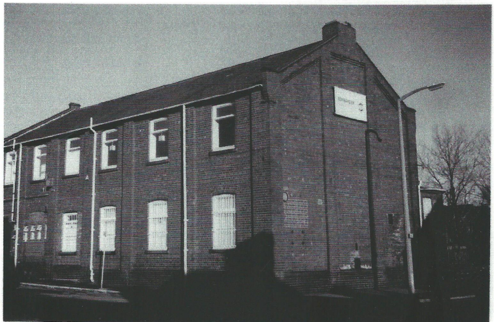
This is a photo of an old building in Hexthorpe; not beautiful, but it has many stories to tell and could soon be disappearing. Any offers as to where and what it was used for?

The Internet can also be used to find historical information. Did you know, for example, that there was a large workhouse at the entrance to Hexthorpe? 'In 1837 the poor law guardians purchased for £690, two and a half acres of land in the Hexthorpe Road, on which was erected and finished in 1839 a Workhouse for the use of fifty-four parishes and townships.' Search for 'Doncaster Workhouse' and numerous sites will come up, with maps, plans, descriptions and photographs.