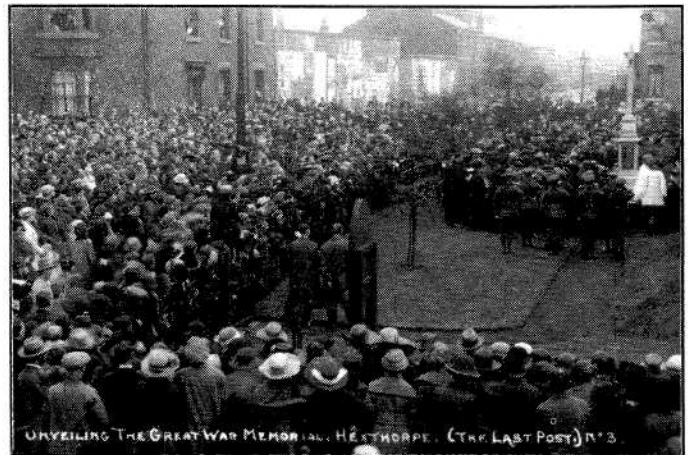
UNVEILING THE GREAT WAR MEMORIAL, HEXTHORPE. (THE LAST POST) N°3

Hexthorpe or elsewhere who was present at the unveiling ceremony. We would be very interested if they were able to make the picture come alive for us.